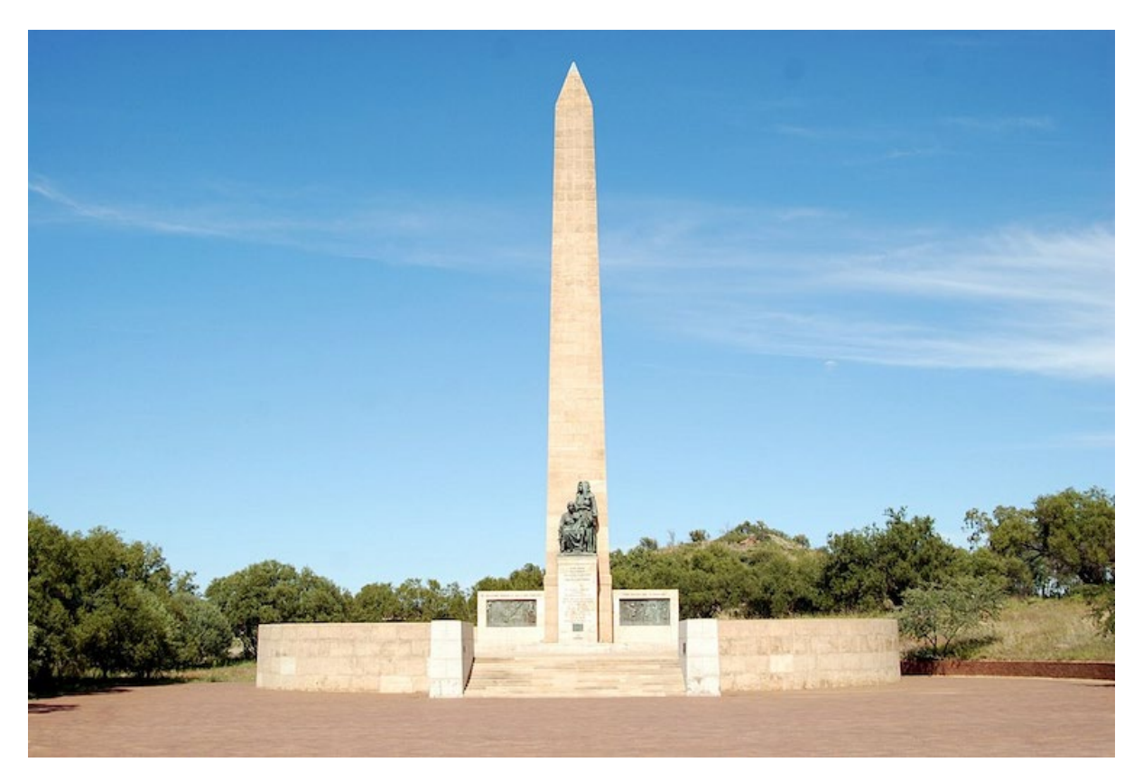
National\ Women's\ Memorial\

Drive down historical St Georges and President Brand streets.